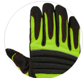
Knuckle protection on the back