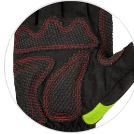
Anatomical palm reinforcements